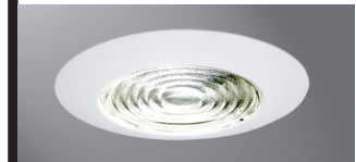
173PS Fresnel Lens, White Polymer Trim