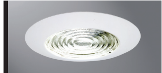
173P Fresnel Lens, White Trim

Compatible with Halogen, Incandescent, LED* or CFL* lamps.