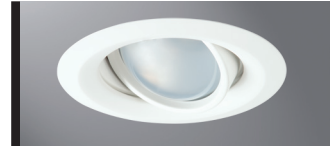
5165WH White Gimbal, White Trim