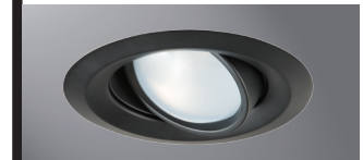
5165BK Black Gimbal, Black Trim