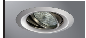
5165SN Satin Nickel Gimbal, Satin Nickel Trim