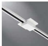
L929 Floating Canopy and Connector