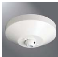
L994 45° Pendant Adapter

Specifications and dimensions subject to change without notice. Consult your Cooper Lighting Solutions Representative or visit www.cooperlighting.com for available options, accessories and ordering information.