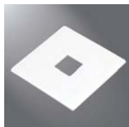
L900 Outlet Box Cover