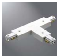
L945L Left T Connector