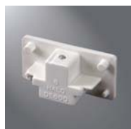
DE641 Dead End