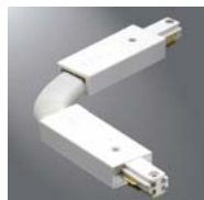
L942 Flex Joiner