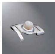
L983 T-Bar Attachment Clip