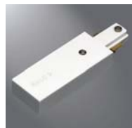
L941 Live End Connector