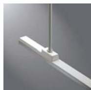
L951 Wire Way Cover for Pendant Assembly Kit