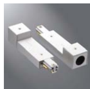
L989 Conduit Continuation Kit