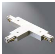
L945R Right T Connector