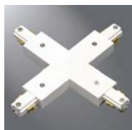
L946 X Connector