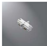
L949 Mini Joiner