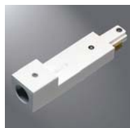
L947 Conduit Connector