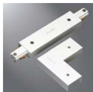
L943 Straight/L Connector