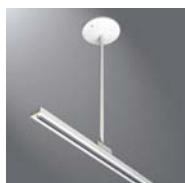
L992 Pendant Kit Assembly