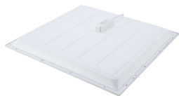
SmartBright Panel RC055