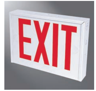
RXS - STEEL EXIT SIGNS

COMPLIANCES: UL924 Listed; Damp Location, NYC Code Compliant