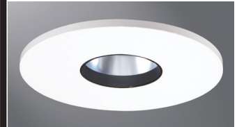
3002WHC White with Clear Reflector

Aperture: 1-3/4" [45mm] Ceiling Opening: 3-3/4" [95mm] Outside Diameter: 4-1/4" [108mm]