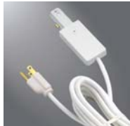
LZR208 Cord and Plug Feed