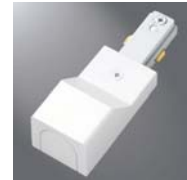
LZR204 Conduit Adapter Feed