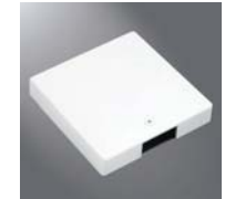
LZR206 T-Bar Canopy