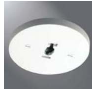
LZR209 Monopoint Feed