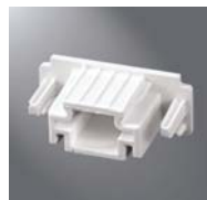
DE112 Dead End