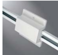
LZR202 Floating Canopy and Connector Feed