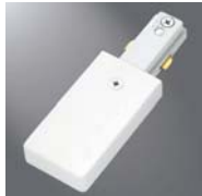
LZR201 Live End Feed