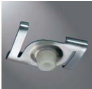
LZR207 T-Bar Mounting Clip