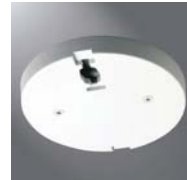
LZR210 Monopoint Feed - Low Voltage