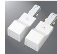
LZR205 Conduit Continuation Feed