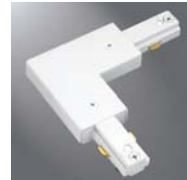
LZR203 Adjustable L and Straight Connector Feed