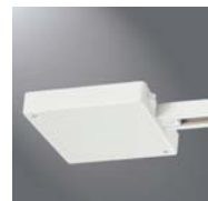
LZRC201, LZRC203 Current Limiters

Specifications and dimensions subject to change without notice. Consult your Cooper Lighting Solutions Representative or visit www.cooperlighting.com for available options, accessories and ordering information.