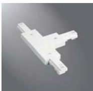
LZR213L Left Handed "T" Connector