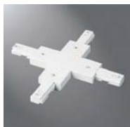
LZR214 "X" Connector