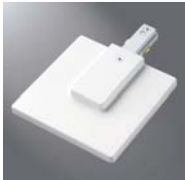
LZR200 Live End Feed with Junction Box Cover