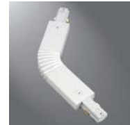
LZR211 Flexible Connector Feed