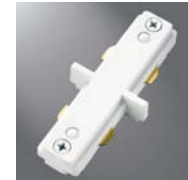
LZR212 Mini Connector