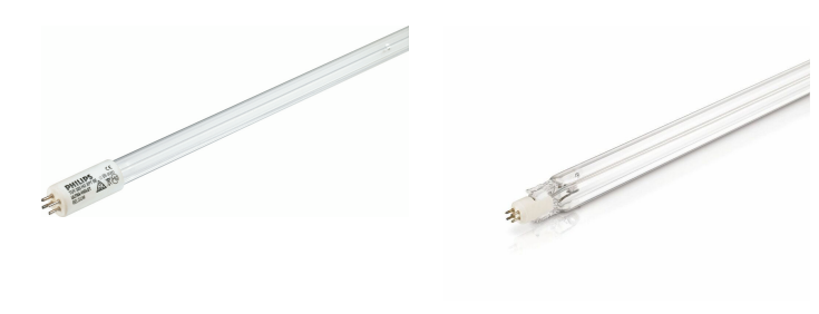
XPPR XDTUVXPT 0008