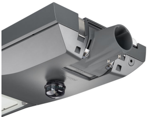
SunStay Pro _ Side Entry