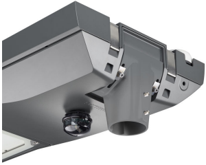
SunStay Pro _ Post Top Entry