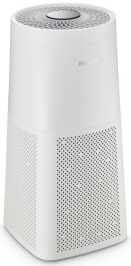
UVCA200 UV-C Floor standing air unit