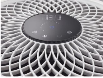
UVCA200 UV-C Floor standing air unit