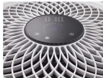
UVCA200 UV-C Floor standing air unit