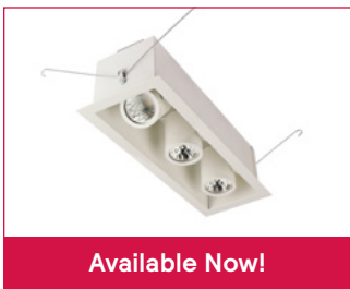
OmniSpot Recessed Multiple Cylinders