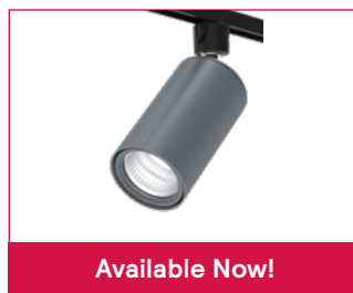
3D Printed Track Heads