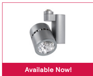
Alcyon Vertical Track Heads