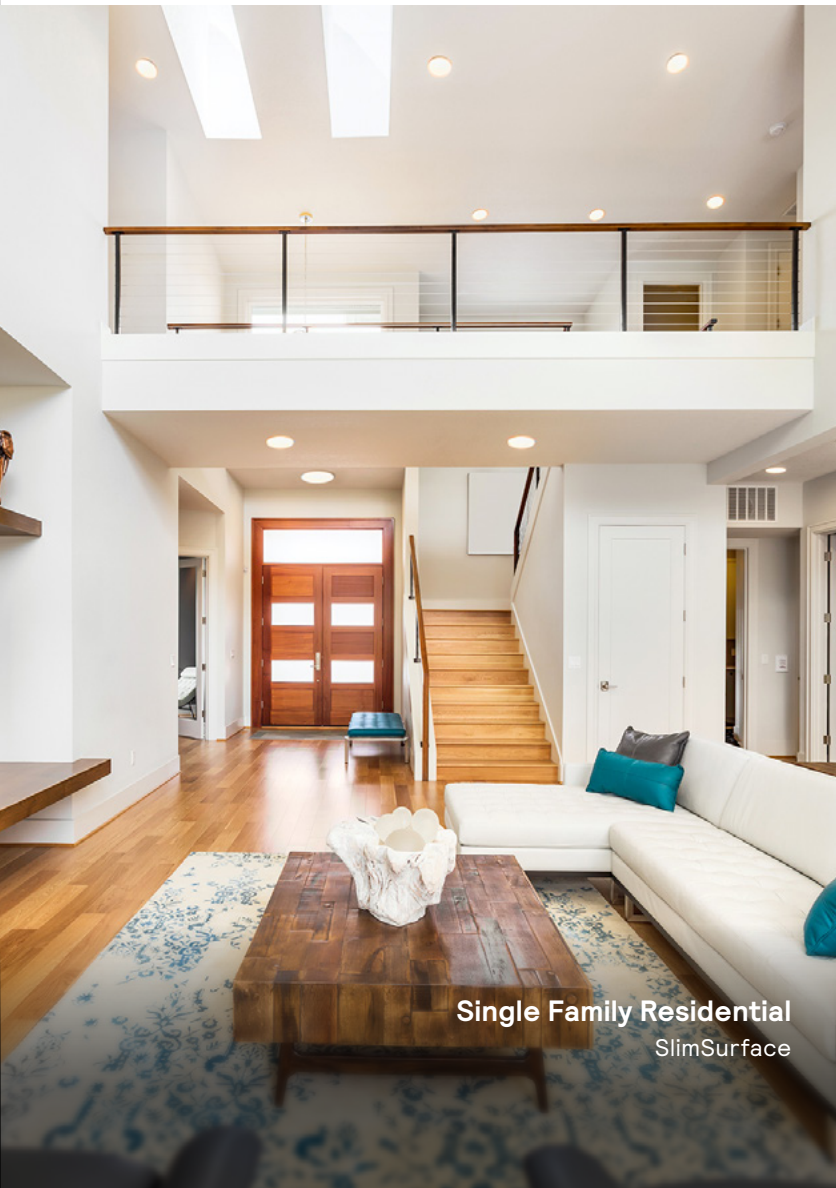
Single Family Residential SlimSurface