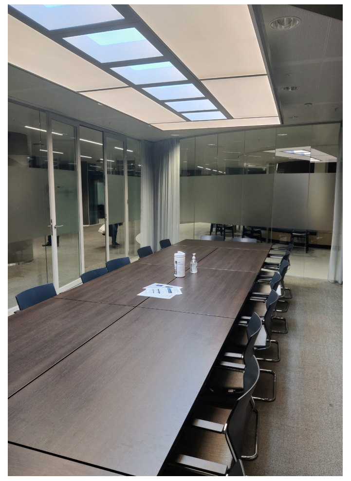
Figure 2. Room 2 with NatureConnect installed