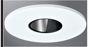
3020WW Wall Wash Downlight with White Trim Ring