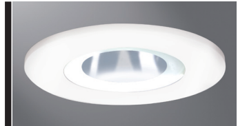
3008FG White with Frosted Glass

Trim Aperture: 2-1/2" [64mm] Clear Center Diameter: 1-7/8" [48mm] Ceiling Opening: 3-3/4" [95mm] Outside Diameter: 4-1/4" [108mm]