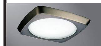
5230TBZ Tuscan Bronze Squircle Trim, Frost Glass Lens