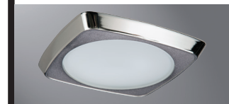
5230PN Polished Nickel Squircle Trim, Frost Glass Lens