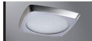
5230AH Aluminum Haze Squircle Trim, Frost Glass Lens

For use in other's housings, refer to U.L. Classification list at www.cooperlighting.com.