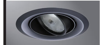
6215BK Black Gimbal