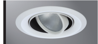
6215WH White Gimbal

Compatible with Halogen, Incandescent, LED* or CFL* lamps.