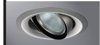
6215SN Satin Nickel Gimbal