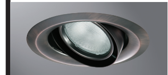
6215TBZ Tuscan Bronze Gimbal