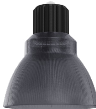
GYSM Smokey Grey